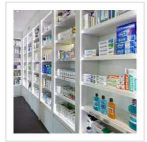
Medical Storage Racks