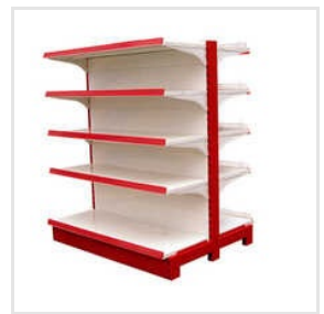
Gondola Display Racks