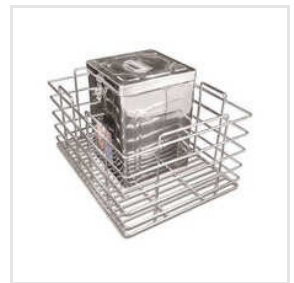
SS Silver Grain Trolley