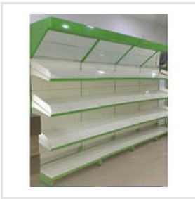
Supermarket Vegetable Display