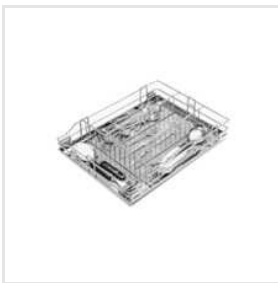
SS Cutlery Basket