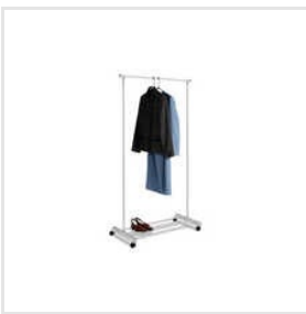
Hanging Item Display Racks