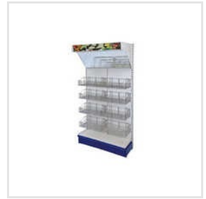
Fruits And Vegetable Display Racks