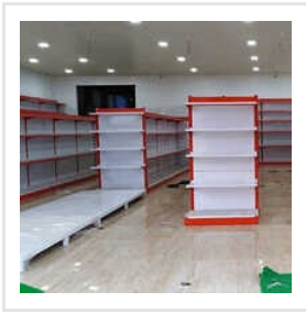
Pharmacy Storage Racks