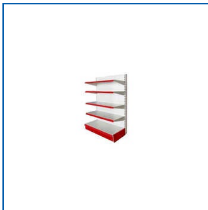
WALL MOUNTED DISPLAY RACKS