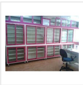
Supermarket Medical Storage Racks