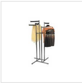
Garment Display Rack