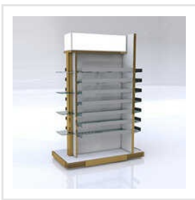
Chemist Storage Racks