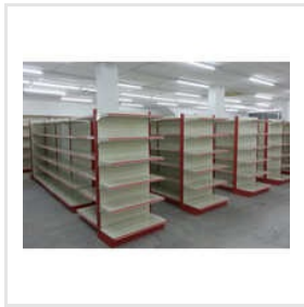
Supermarket Gondola Display Racks